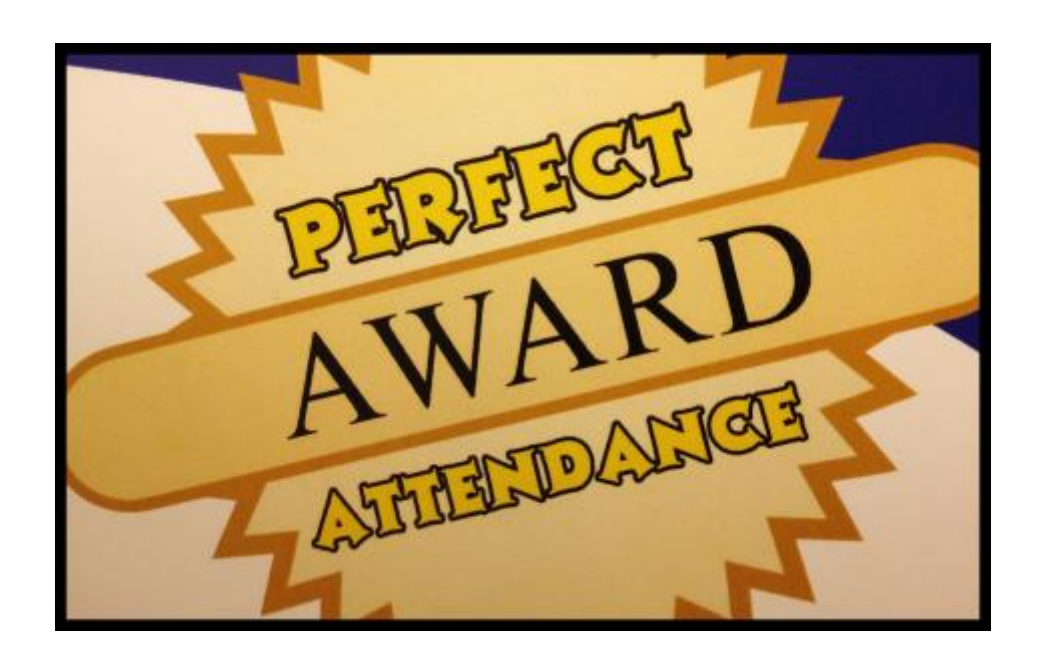
The first £5 voucher will be for the parent of any child who has managed to complete a full week of attendance without being late. The names will be collected on the Friday and winner drawn at random on the following Monday in assembly.